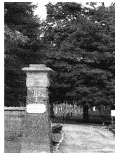
Cemetery

Created by: lulu Record added: Mar 07, 2010 Find A Grave Memorial# 49387475