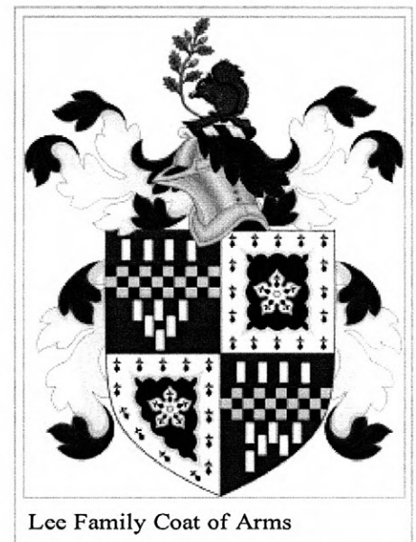
Lee Family Coat of Arms

Lee's Congress was most active in 1785, passing numerous legislation, including establishing a United States dollar tied to the Spanish dollar as the national currency. His most pressing issue, however, was to settle the states' territorial disputes over the Northwest Territory. Throughout his term, Lee remained steadfast that the release of states' territorial claims on the Northwest Territory would enable the federal government to fund itself with land sales. He believed that the urgency of this measure was paramount because borrowing more foreign money was no longer prudent, and he abhorred the movement to establish federal taxes. The sale of these vast federal lands, he concluded, was the