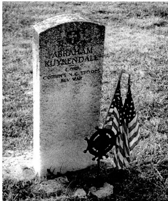
Added by: Red Anthony