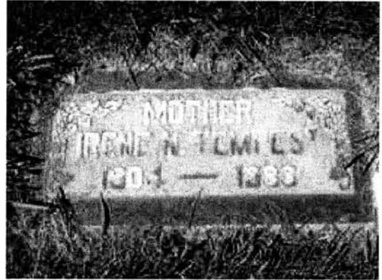
Added by: Burt