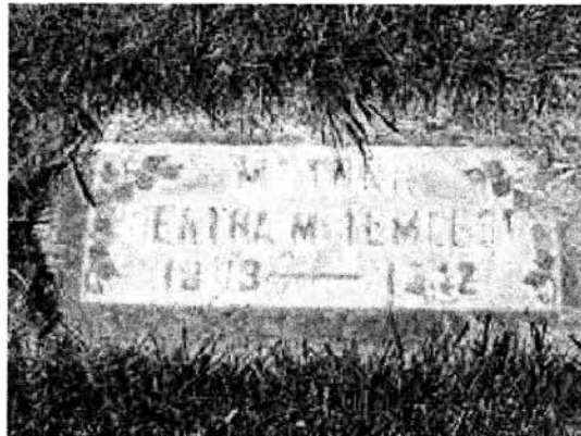
Added by: Burt