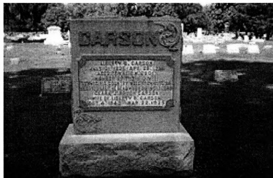
Added by: Pam Estes HOLETON