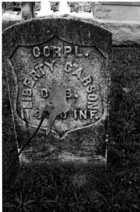
Added by: Pam Estes HOLETON